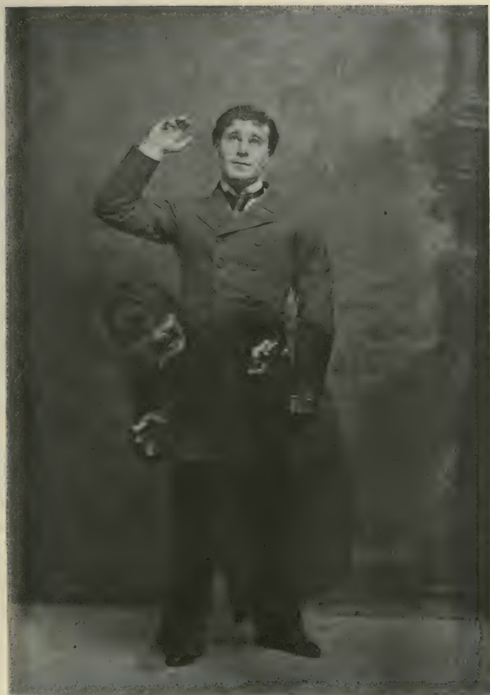
RICHARD MANSFIELD AS DR. JEKYLL AND MR. HYDE